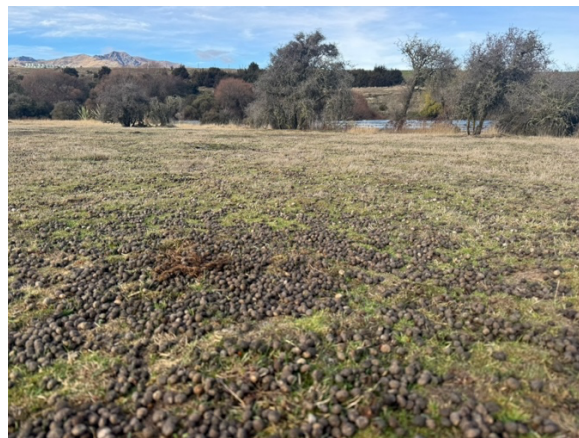
Restoration site 1 – reclaim from the rabbits!