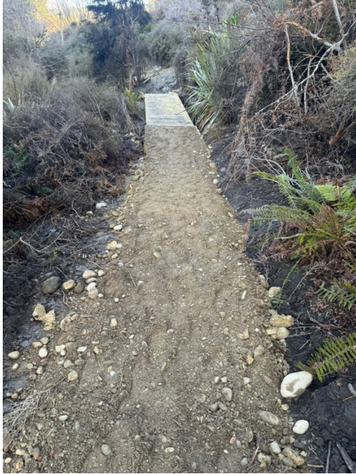
“Pump Shed” boardwalk and gravel