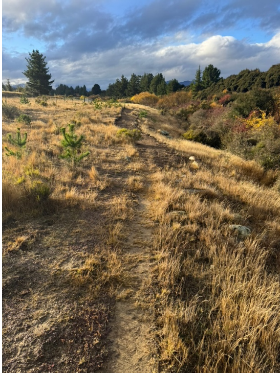
Trail on natural ground with minor camber corrections for accessibility