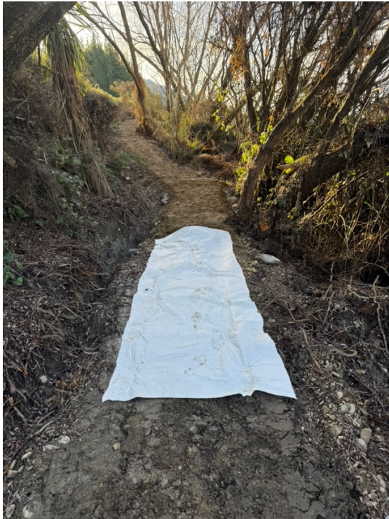
Gravel and filter cloth for improved trail resilience at “Fern Hill”