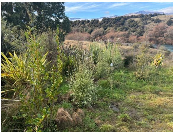
Example of local planting