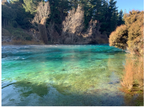
Improved river access