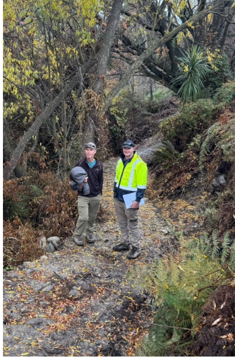
WKC contractors at “Fern Hill”