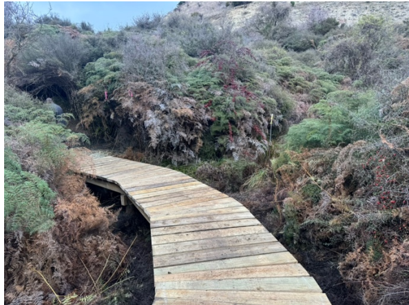
15m raised boardwalk at “Fantail Folly”